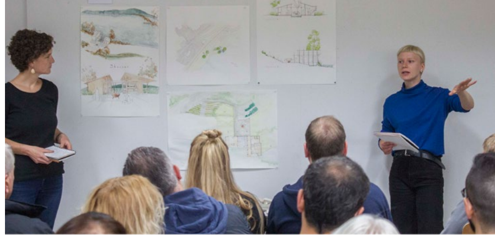
UW and Steneby students presenting in both English and Swedish.