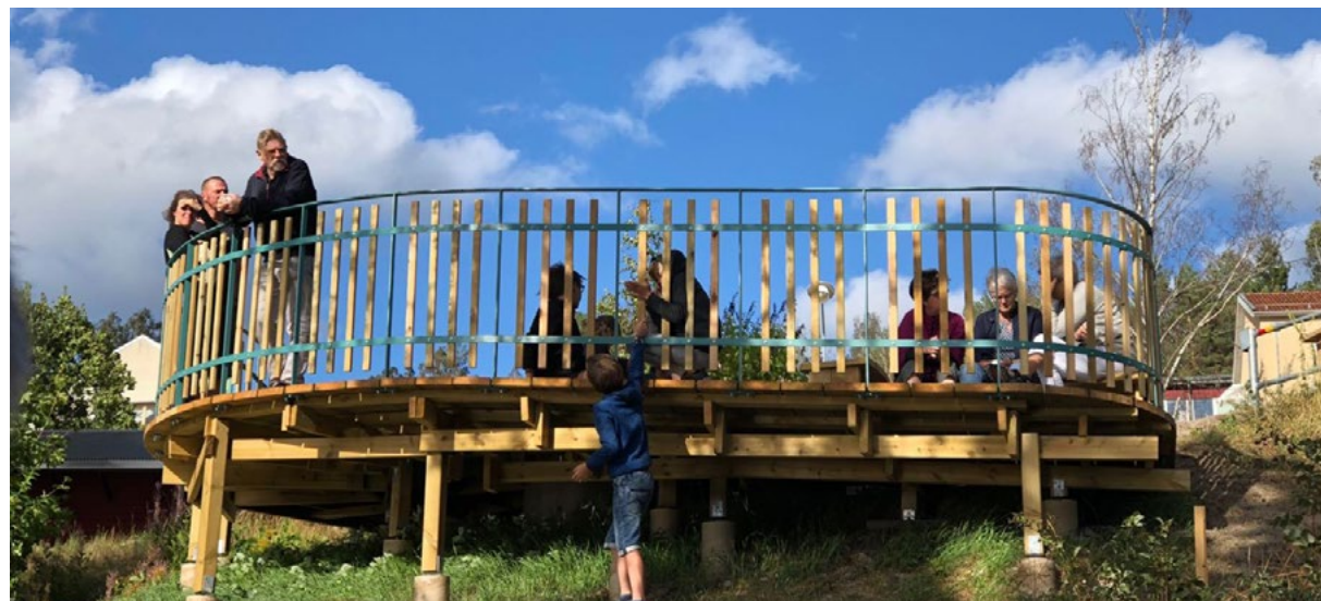
Kids love the bridge colors of the overlook.