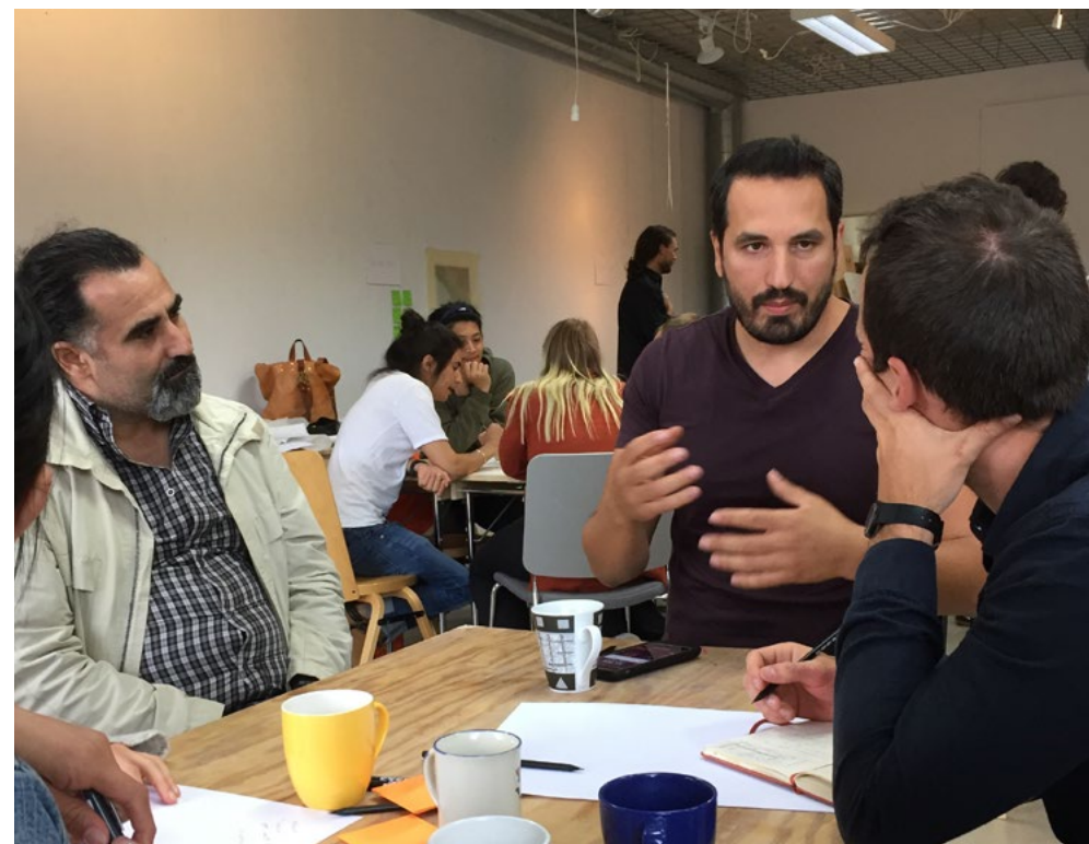
Syrian community members express their feeling about a shared sauna.