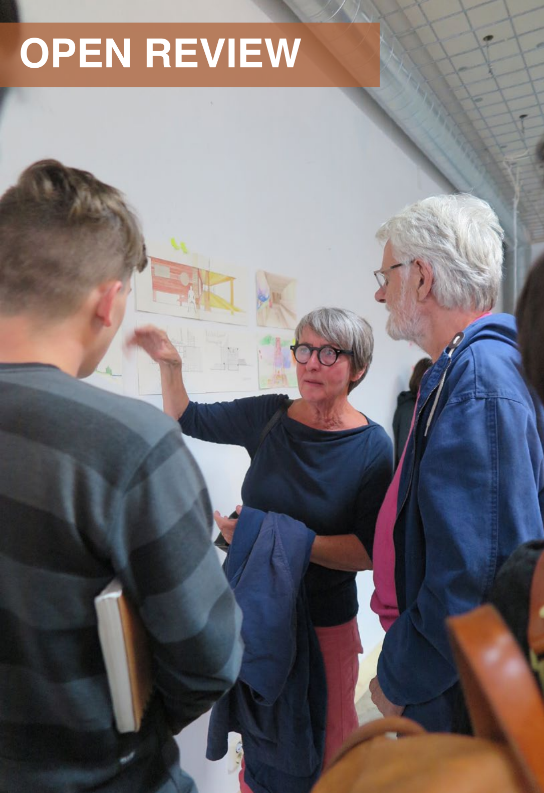
Community members votes on favorite aspects of different designs.