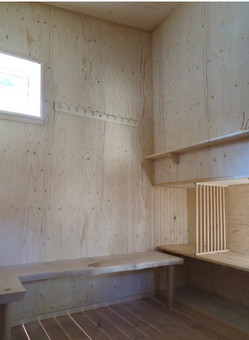
Built-in furniture in the changing room