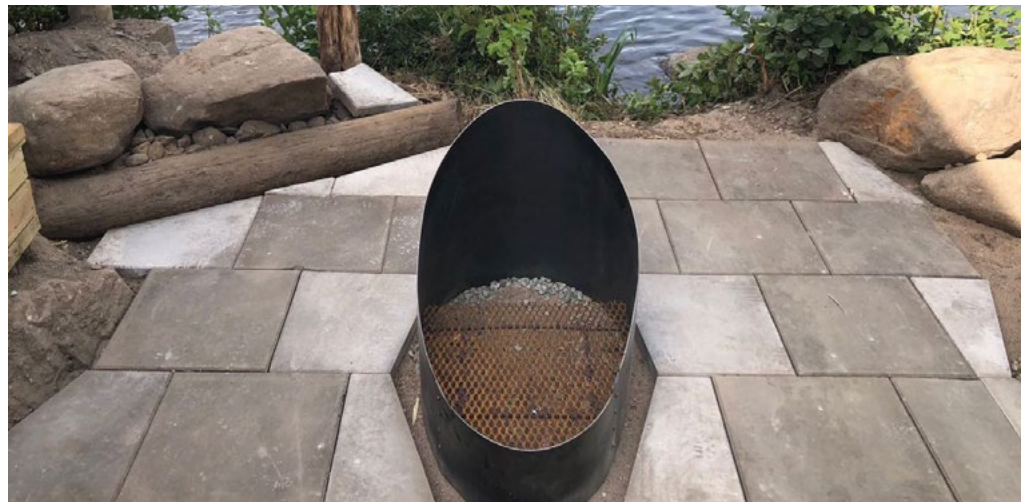
Gathering around fire pits is a tradition shared by both Syrians and Swedes.