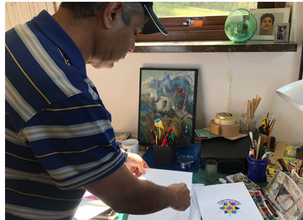
Syrian artist designs the mosaic pattern for the overlook.