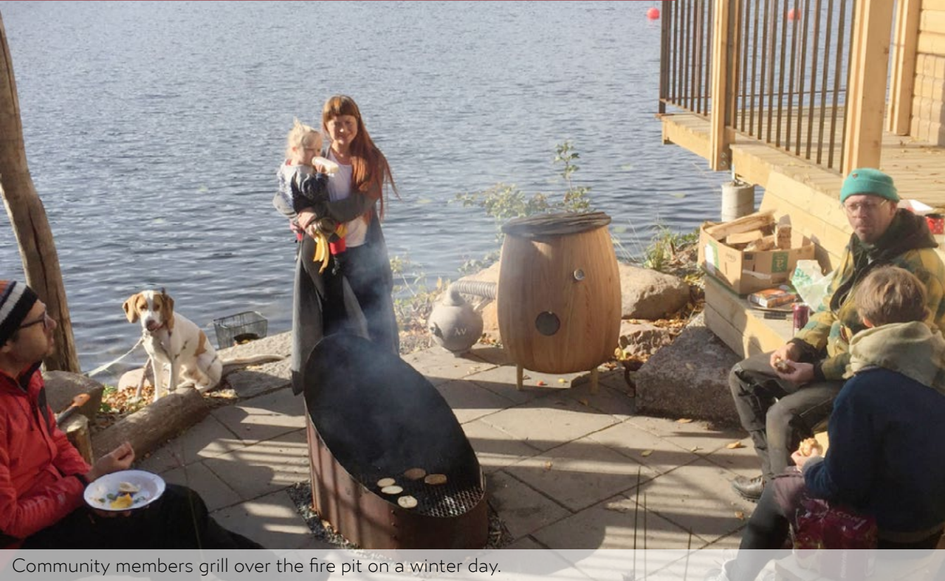
Community members grill over the fire pit on a winter day.