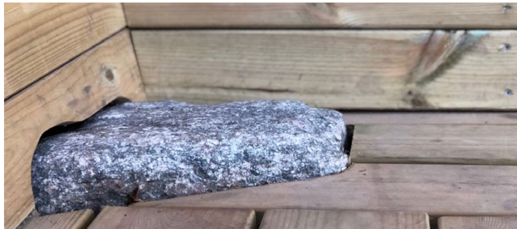
Stone unearthed on-site was embedded in the new bench, marking the memory.