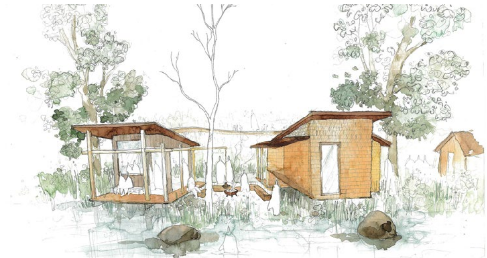
Watercolor rendering of the proposal.