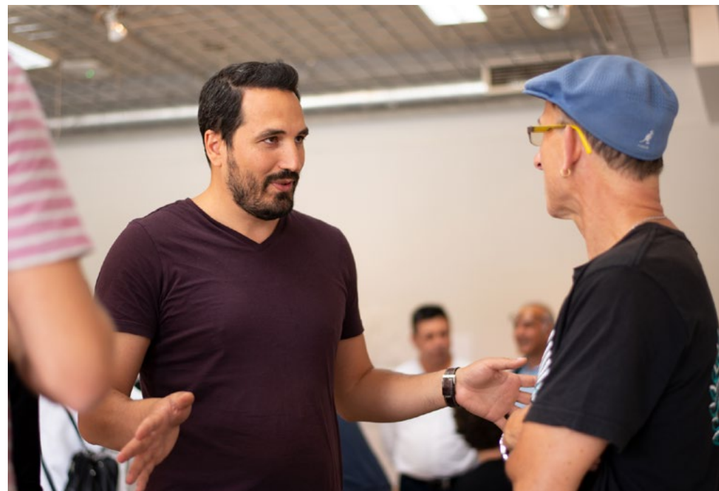
Syrian community member talking to a professor.