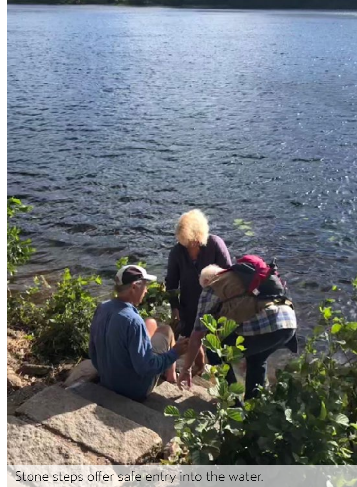
Stone steps offer safe entry into the water.