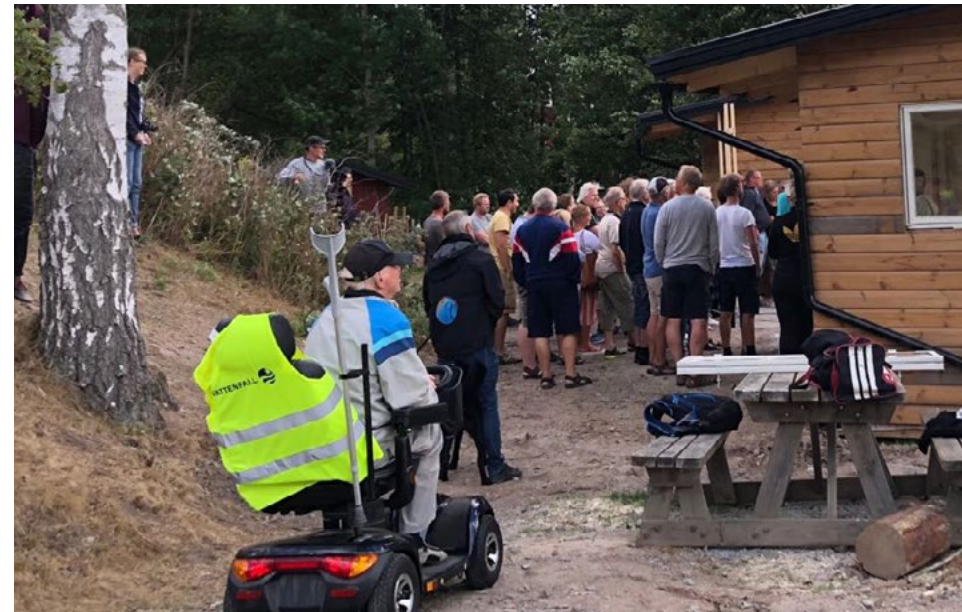
The ADA accessible path allows wheelchair users to enjoy the park.