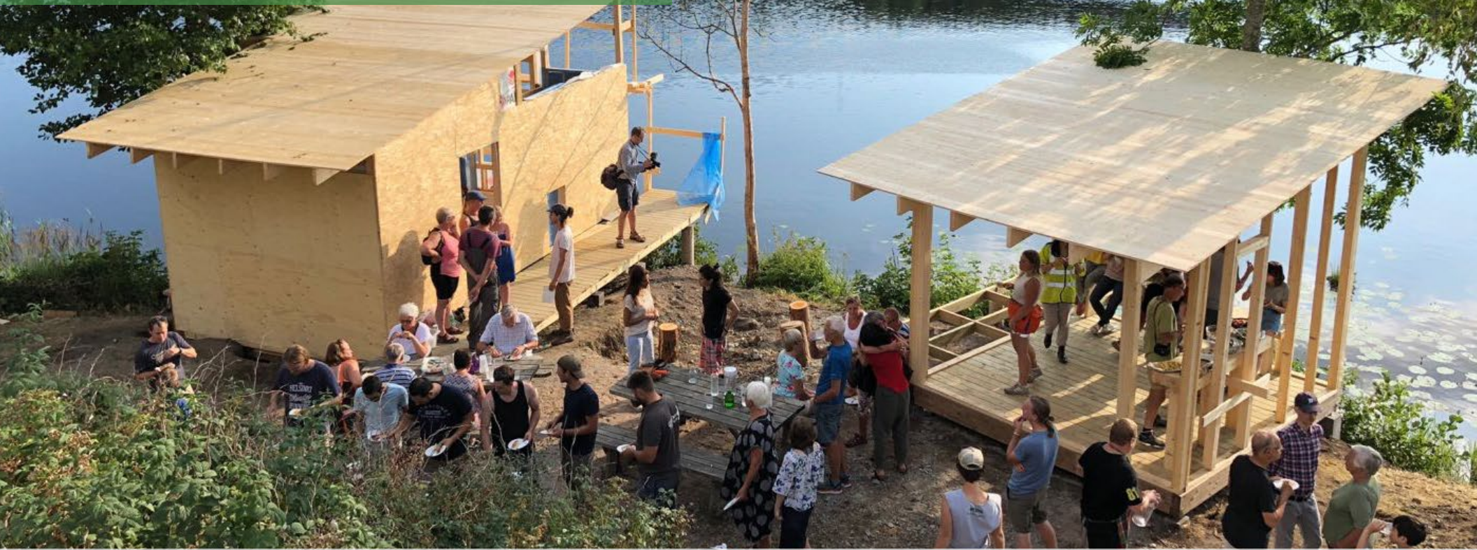
Community members share food and provide feedback on the sauna and the outdoor kitchen.