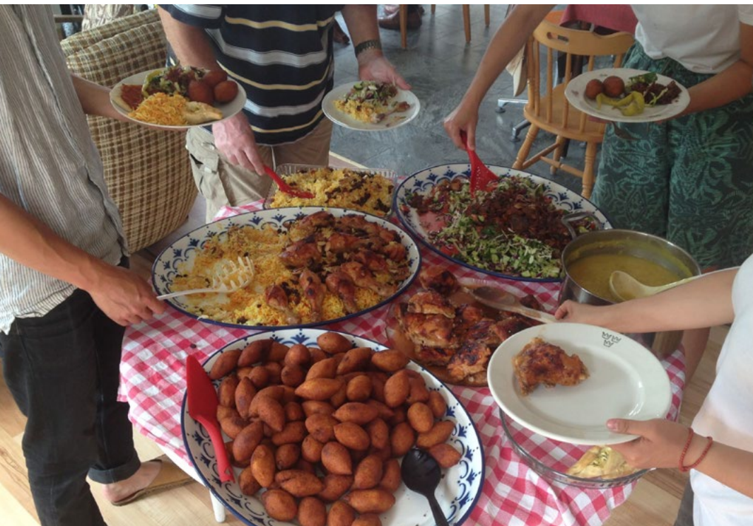
Syrian community members cooked for students, helping to bridge cultures.