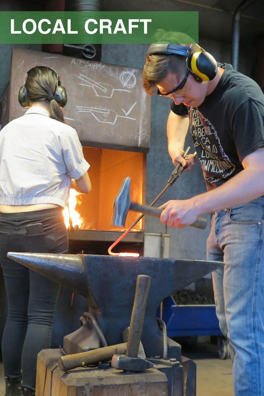
Steneby students taught craft workshops to UW students.