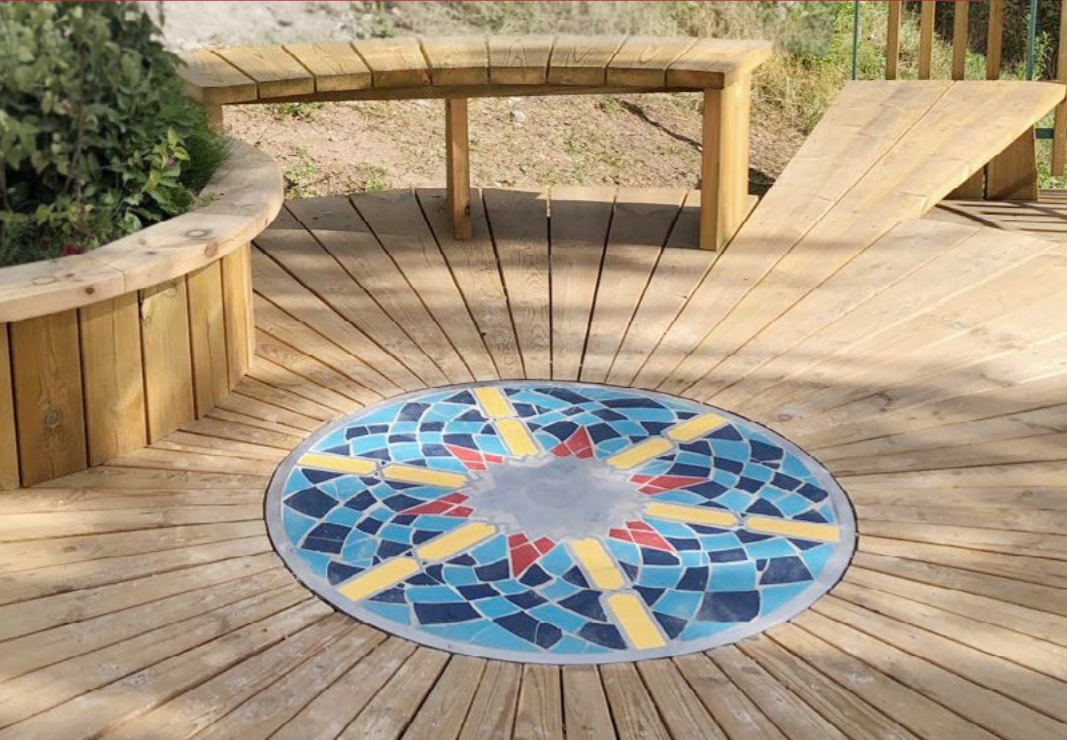
Mosaic designed by local Syrian artist marks the community on the overlook.