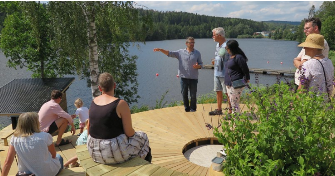
Instructor shows community members the project from the overlook.