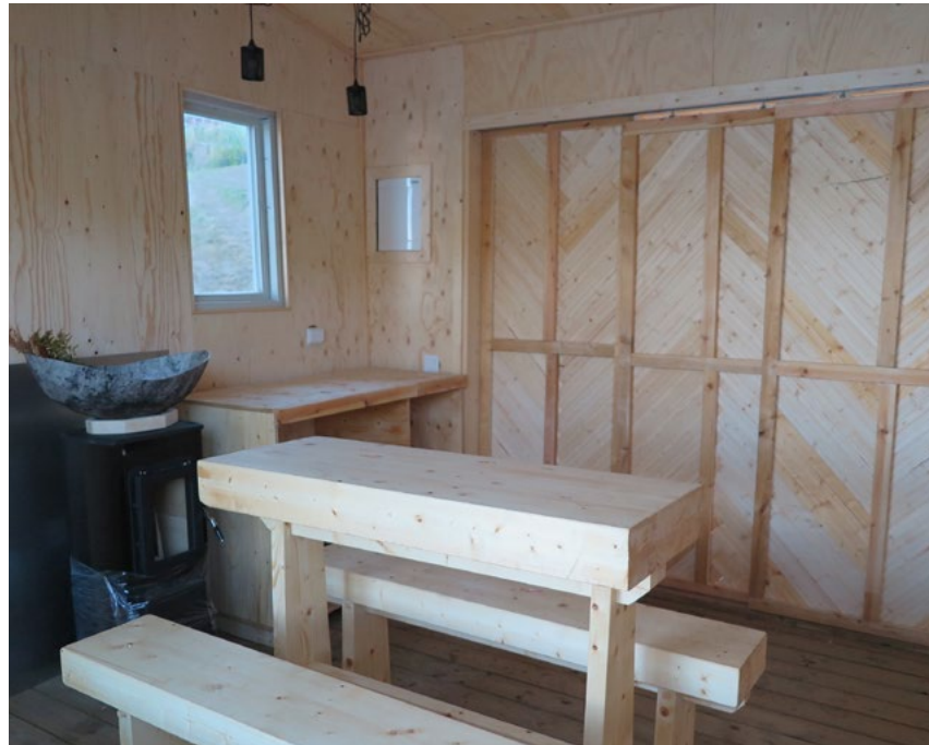
Kitchen with hand-made sliding doors, wood stove, and dining set.