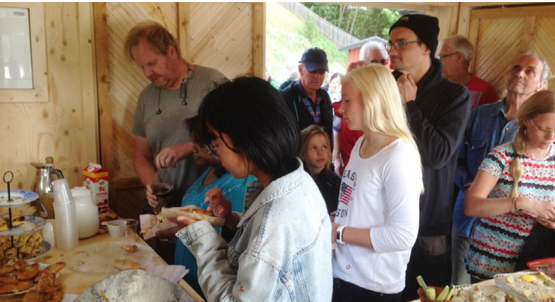
Community members share treats in the newly dedicated open kitchen.