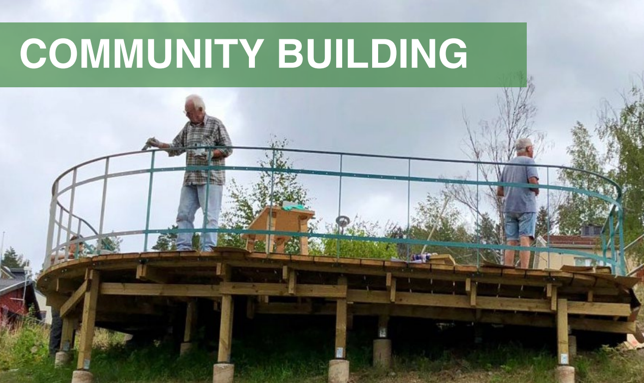
Community members helped in all phases of construction.