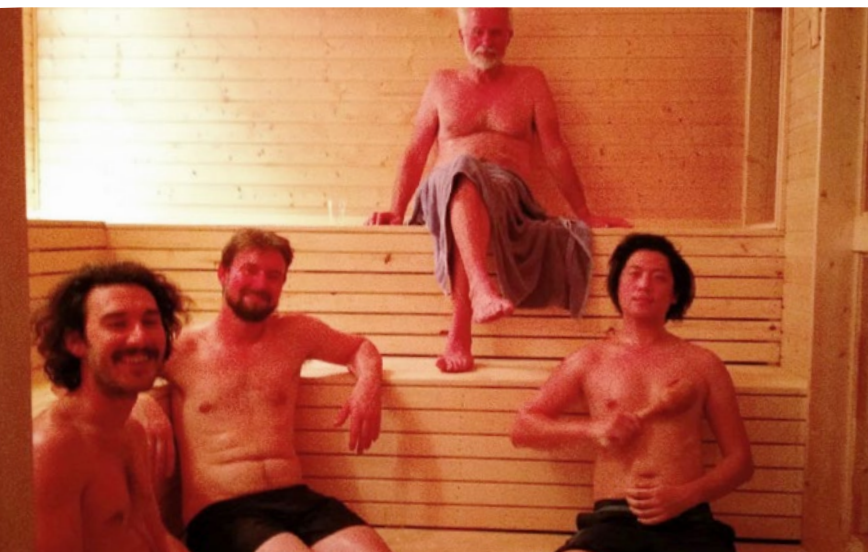
The sauna is programs for separate gender use on specific nights.