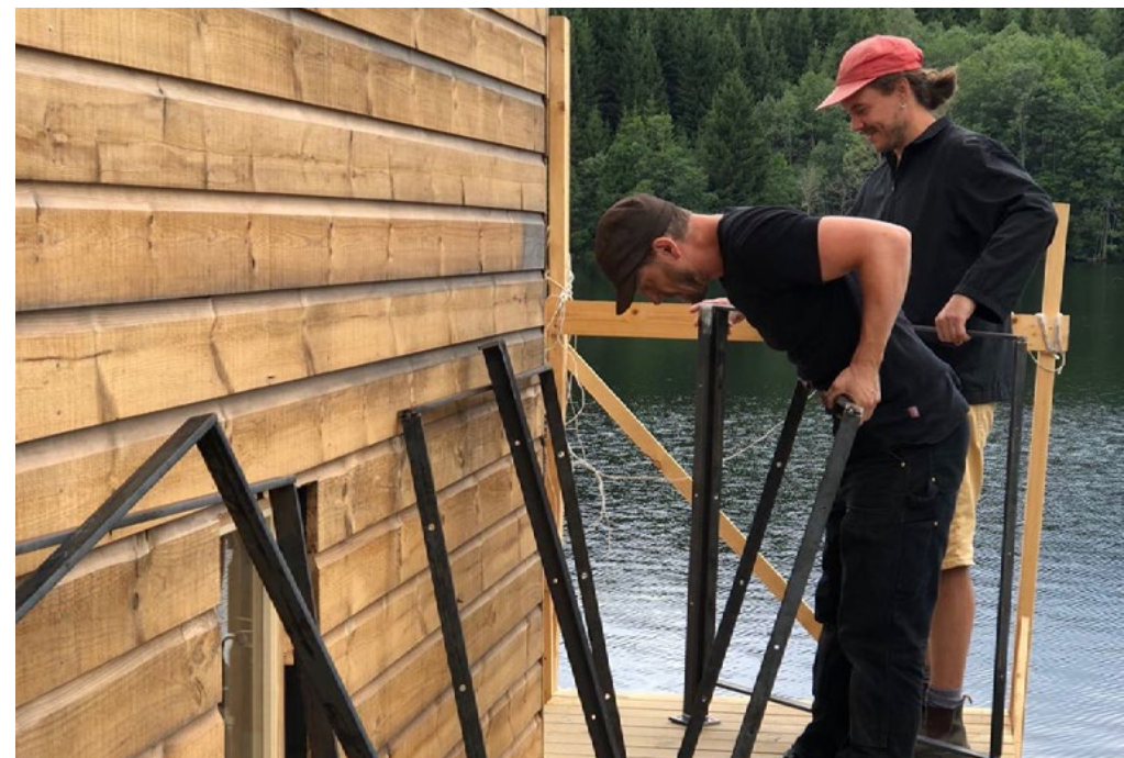
Local blacksmith work with students to fabricate metalwork.