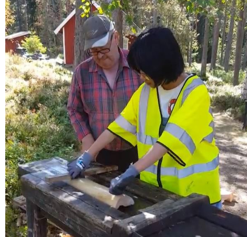
Students make traditional shingles from aspen they harvested.