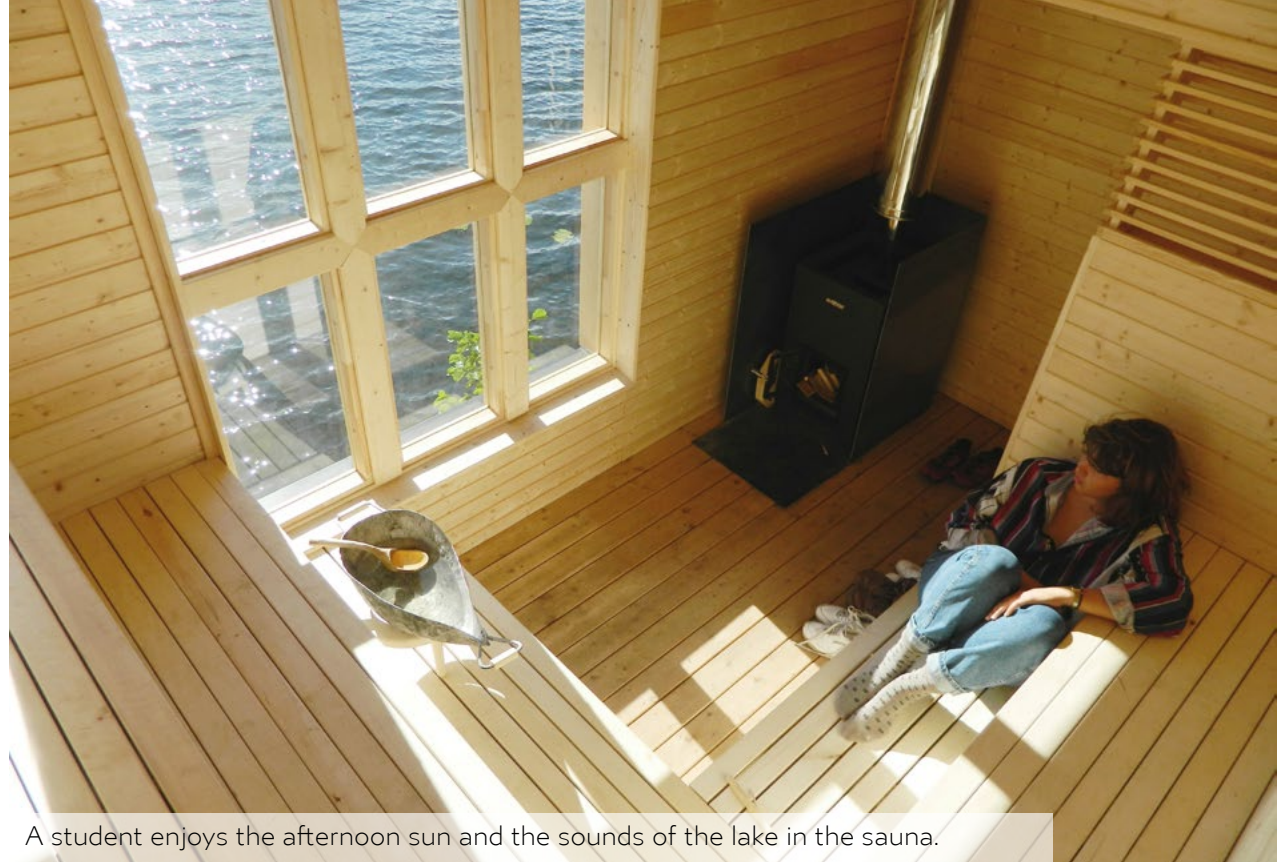
A student enjoys the afternoon sun and the sounds of the lake in the sauna.