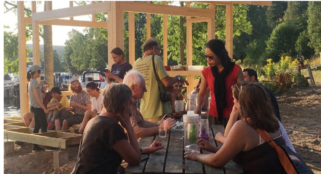
Volunteers, students, and other community members share experiences.