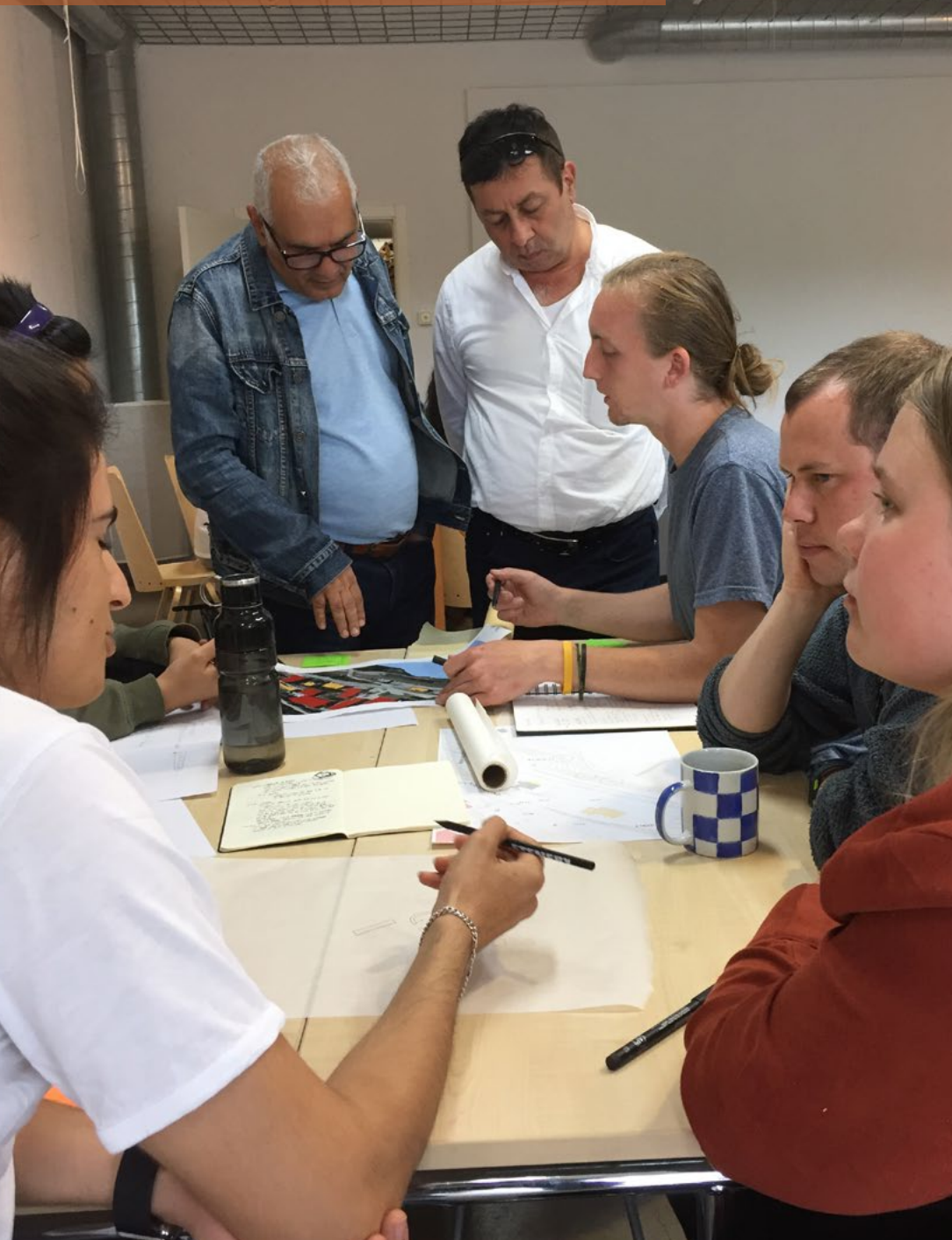
Syrian community members share big ideas for the park.