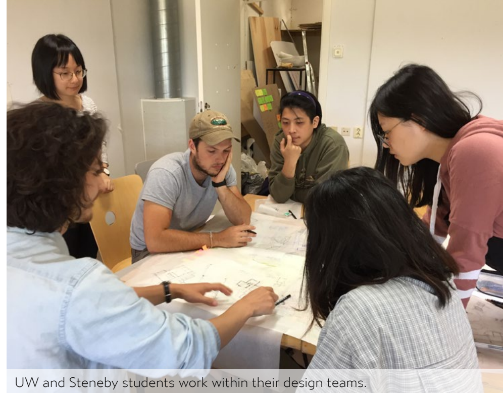
UW and Steneby students work within their design teams.