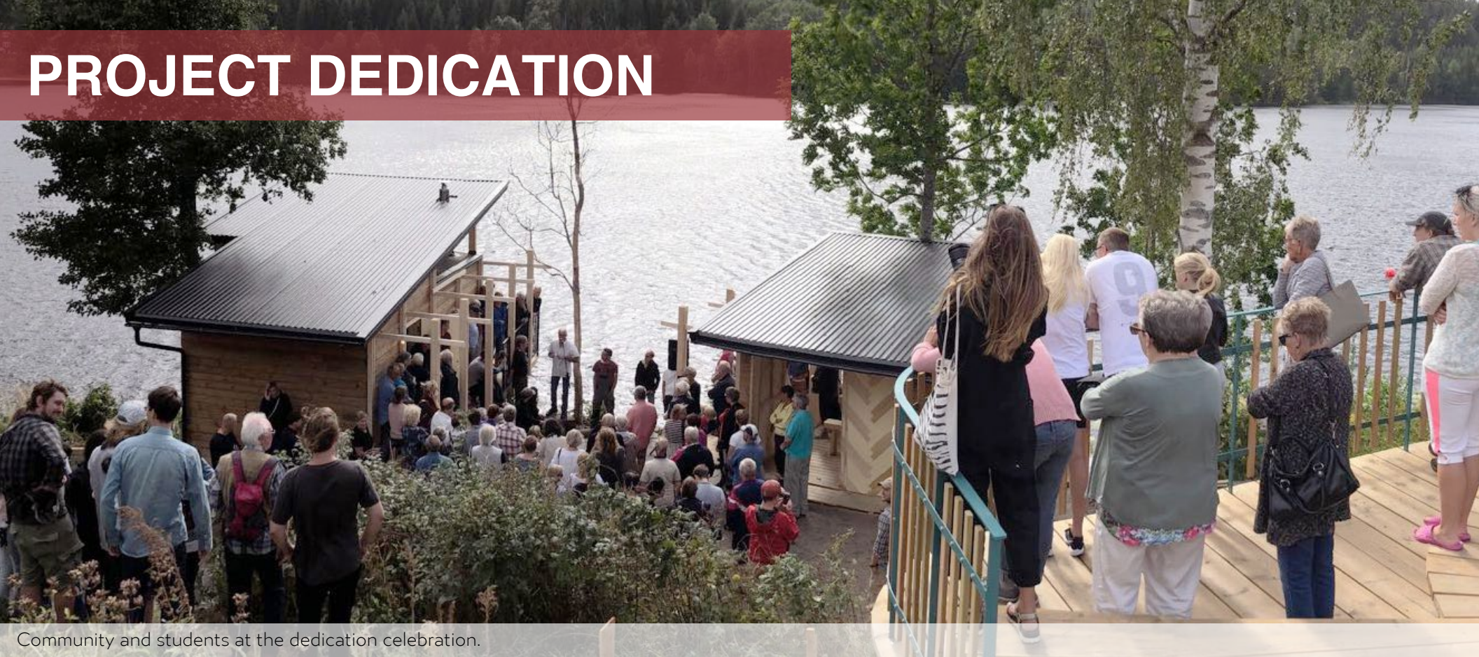
Community and students at the dedication celebration.