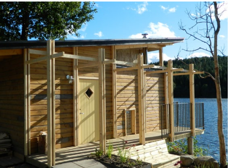
Sauna & Changing Room

Students used handmade aspen shingles and reused pine boards for the wrapping facade.