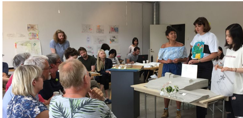
Student teams present several design options to the community.