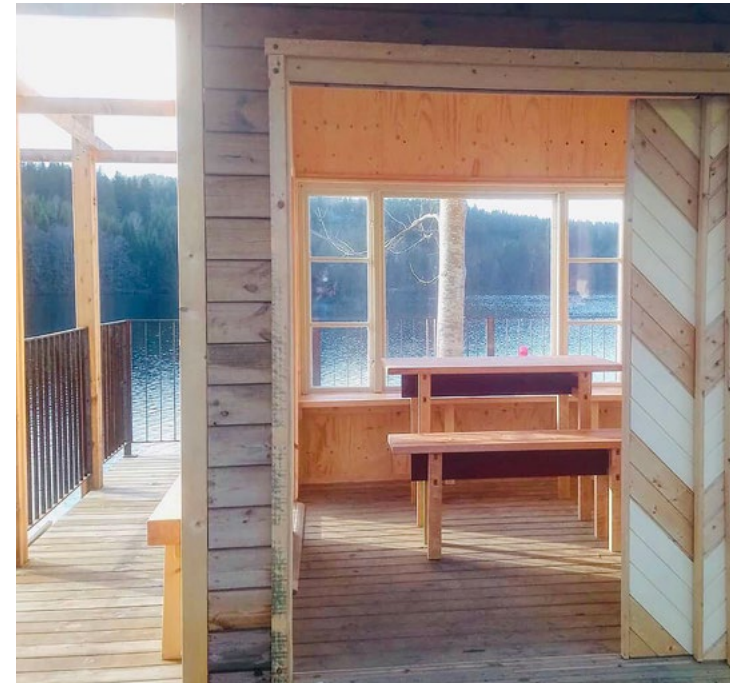
The south window of the kitchen, looking toward the lake