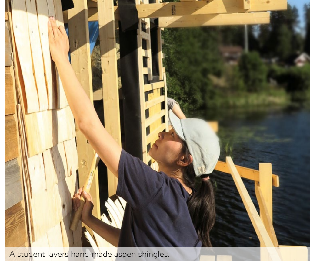
A student layers hand-made aspen shingles.