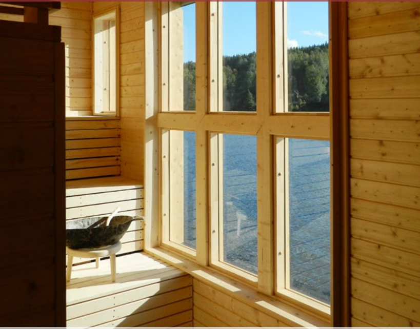
Completed sauna room with view of lake and surrounding nature