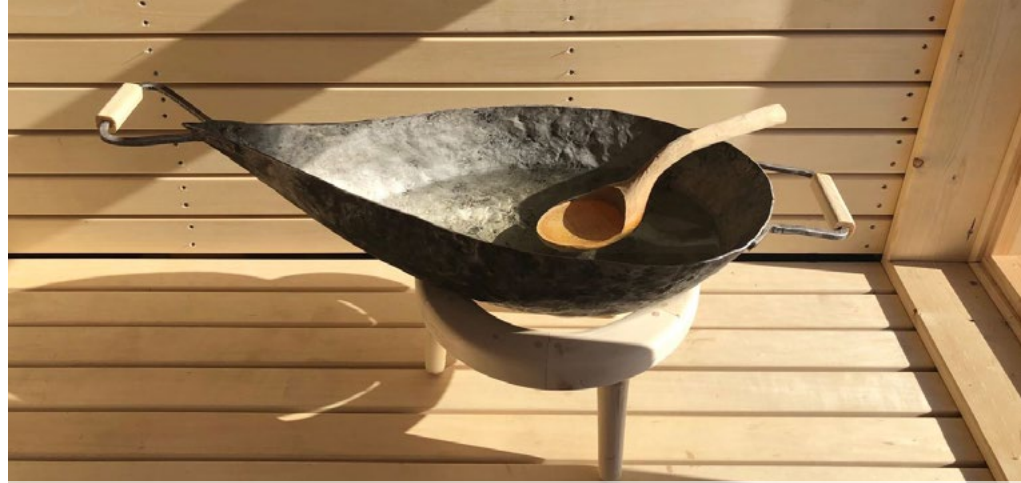
Water basin crafted by Steneby students, inspired by Swedish boats.